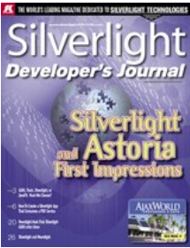
View Current Issue Cover