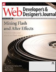
View Current Issue Cover

IBM on SYS-CON.TV AJAX Tools & Resources