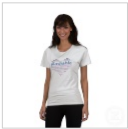
Mashable Heart visit Zazzle